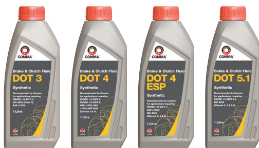
Figure 2 - Synthetic DOT products

There are a range of products to meet the demands of modern vehicles. Synthetic fluids, based on polyalkylene glycol (PAG), are the most common type (DOT3, DOT4, DOT 4 ESP and DOT 5.1). They are compatible with one another and therefore can be mixed however, as with oil and coolant, you should always comply with the manufacturers' specifications for the intended vehicle as using the wrong fluid can seriously compromise braking performance.